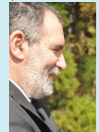
UNIVERSITY OF THE AZORES, SCHOOL OF AGRARIAN AND ENVIRONMENTAL SCIENCES, PORTUGAL